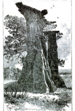
ENCHANTED PEAKS MT. PARK