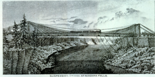
SUSPENSION BRIDGE AT NIAGARA FALLS

PUBLISHED BY L. W. WIGHT. ((LAKESIDE BUILDING)) ((CHICAGO)) 1876.