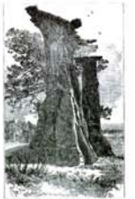
ENLARGED PINE IN PARK