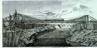
BRIDGE OVER THE MISSOURI RIVER

PUBLISHED BY L. W. WIGHT. LAKESIDE BUILDING CHICAGO 1876.